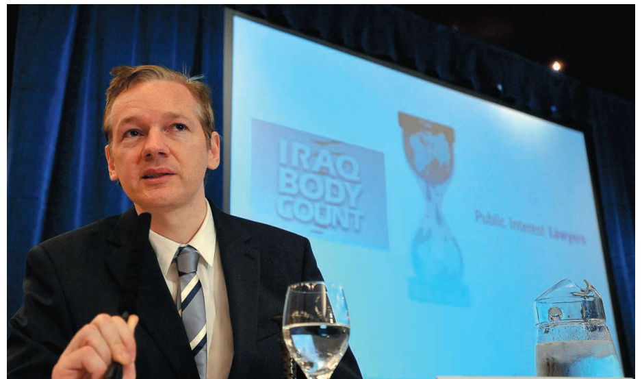
Buried data. WikiLeaks' Julian Assange at a briefing on the release of classified Iraq war records.

According to the IBC analysis of the leaked SIGACTS data, published online on 25 October, more than 109,000 violent deaths in Iraq were logged by the U.S. military between January 2004 and December 2009. Of these, over 79,000 were civilian deaths comparable to those logged by IBC, which recorded about 91,000 over the same period. By extrapolating from a sample of the data, IBC estimates that at least 27,000 civilian deaths went unrecorded by the U.S. military, while the military observed 15,000 comparable deaths that the media missed. Most of these unreported deaths were from small inci-