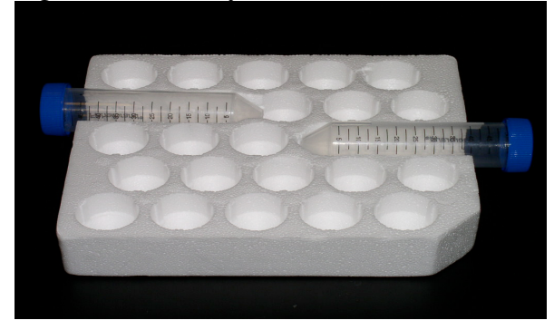
Fig. 5. Conicals/hybridization chambers on Styrofoam base

14. Get the 50ml conical from step 12 and place it down on the bench. Add a total of 50ul ddH_2O to the inside base of the tube. Do this by dividing the 50ul into 3 drops, and spacing them evenly down the base (near the cap, the middle, and the bottom). Do NOT jostle the tube so that the very tiny beads of water dissipate and water moves all around. The beaded water will help keep the hybridization "chamber" humidified, but it is important to keep the array from contact with the water. Place the array carefully into the conical and set in the Styrofoam base. Incubate at 50°C overnight.